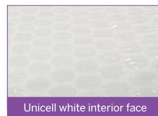
Unicell white interior face