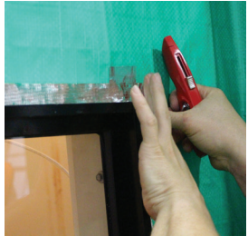
58% reduction in air infiltration was achieved when Thermoseal Wall Wrap was installed with overlaps and window frames sealed with tape.