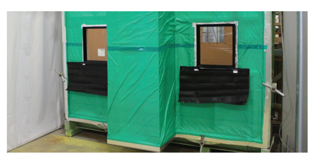
82% reduction in air infiltration was achieved when Thermoseal Wall Wrap was installed with overlaps, window frames, top plate and bottom plate sealed with tape.