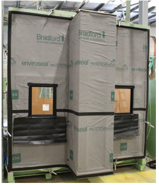
The test was also carried out with Bradford Enviroseal Wall Wrap and the results were comparable.