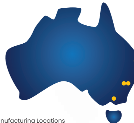
● Manufacturing Locations

We are also sustainable in our manufacturing, using up to 80% recycled glass in the production of insulation and ensuring our processes use the latest technology to reduce waste and protect our resources and environment.