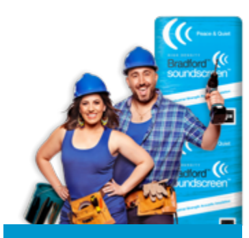
BRADFORD SOUNDSCREEN ACOUSTIC INSULATION