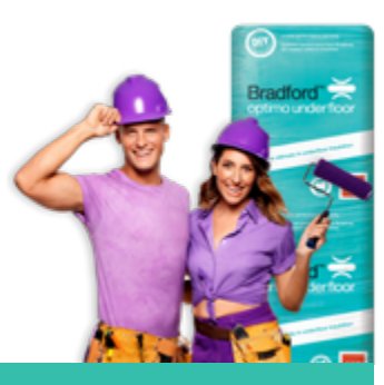
BRADFORD OPTIMO UNDERFLOOR INSULATION