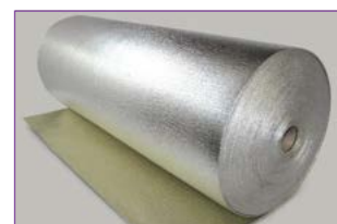
Unicell 54m 2 roll