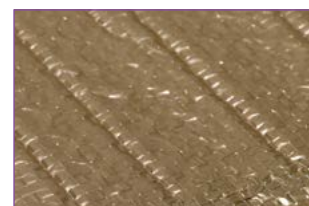
Unicell exterior face